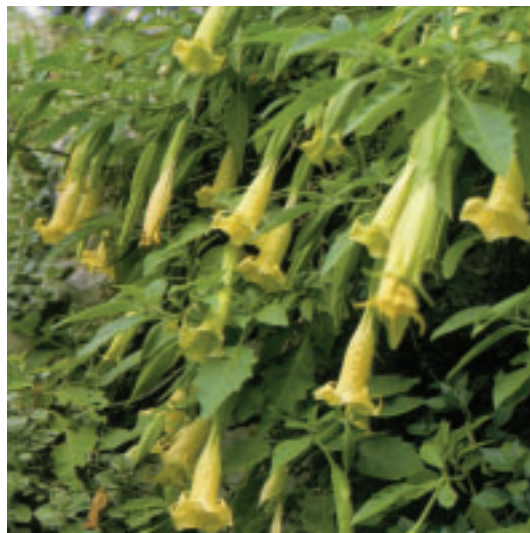
Fig. 2: Flowering Datura plant.

This ornamental plant is frequently found in western Europe gardens due its fragrance and