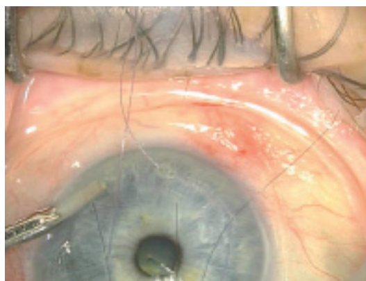
Fig. 2: Anterior chamber maintainer.

Scleral flap sutures (nylon 10/0) are pre-installed: two adjustables laterally (Figure 1) and two releasables (i.e., fixed) in between. A corneal paracentesis is made infero-temporally using a clear-cut side port knife of 1.2 mm (Alcon®). The conic 1.3 mm Blumenthal anterior chamber maintainer (BD-Visitec®, Franklin Lakes, New Jersey, USA) is positioned (Figure 2) with the bottle of BSS (Alcon®) at 30 cm above the patients' eye. A trabeculectomy is