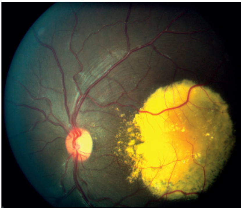
Fig 2. Fundus photograph of the left eye with typical findings for Coats' disease: subretinal yellow exudation at the posterior pole with glistening yellow cholesterol crystals. Telangiectatic vessels, localized more in the periphery, are not visualized on this picture.