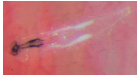
Fig. 1b: maggot with translucent and segmented body and two large dark oral hooks connected to a white cephalopharyngeal skeleton

Ophthalmomyiasis is classified as orbital, external or internal, based on the site of larval invasion. Large numbers of larvae invading and destroying orbital contents cause orbital myiasis. External ophthalmomyiasis refers to superficial infestation of ocular tissue, including the conjunctiva. Internal ophthalmomyiasis occurs