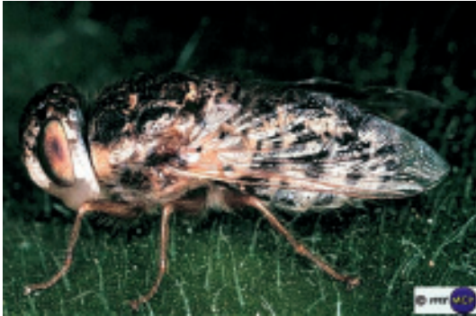
Fig. 2: Oestrus ovis : adult insect