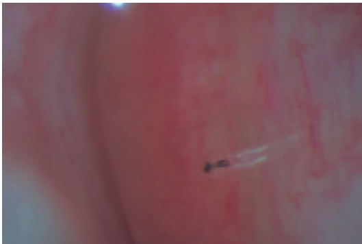
Fig. 1a: maggot on the conjunctiva near the plica interna

On examination we found a slightly congested conjunctiva, but otherwise quiet anterior segment with five small (1mm), transparent, moving maggots in the fornix, on the plica interna and under the upper eyelid (fig 1a). The maggots avoided the slitlamp beam, as they were photophobic. They stuck to the conjunctiva and were very difficult to remove using a cotton