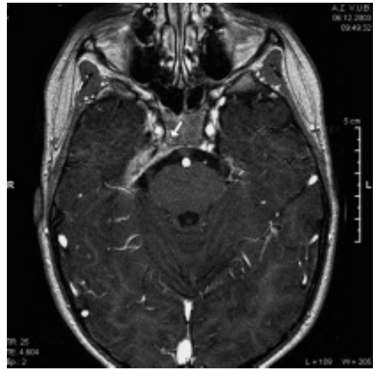
Fig. 2A and 2B: T1-weighted axial MR images showing a right mastoiditis and otitis media. It confirms an inflammation of the meninges around the right petrous apex and of the walls of the right sinus cavernosus.

Already within the first days after surgery an initially minute but steadily progressive improvement of the lateral deviation of the right eye was noticed. Ten days after surgery a Lancaster examination confirmed a partial recovery of the sixth nerve palsy.