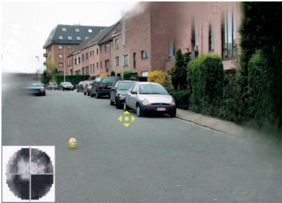
Fig. 2c. Images and corresponding visual field examinations of (a) a normal eye, and an eye affected by (b) an early or (c) later stage of glaucoma. The yellow symbols in Figures (b) and (c) represent the patient's fixation point. Objects located completely in the blind areas are not seen. These areas are filled-in with the colors and patterns of the surround.

parts of the texts they are reading. The filling-in of the field defect with the background color of the sheet of paper and some text-like forms, can explain why they do not perceive black or gray spots. But as the brain probably does not succeed in producing a sensible text, these patients do notice that they have a visual problem.