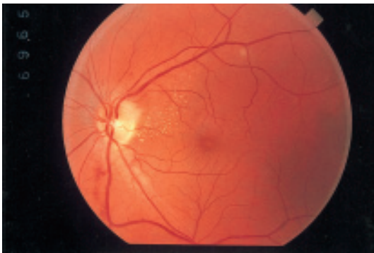
Fig 2a. Severe disc edema with minimal macular edema and a retinal focus superotemporal to the fovea.

examination of the right eye revealed no particularities. Examination of the left eye showed disc edema, especially in the superior segment, with minimal macular edema (fig. 2a). Visual field testing revealed a mild left central scotoma. She was not given treatment initially and on examination 4 days later the visual acuity in her left eye had improved to 20/30. Ophthalmoscopy of the left eye now showed disc edema surrounded by flame-shaped hemorrhages and a macular star pattern of lipid exudates. Additionally, there was a white retinal focus superotemporal to the fovea (Fig. 2b).