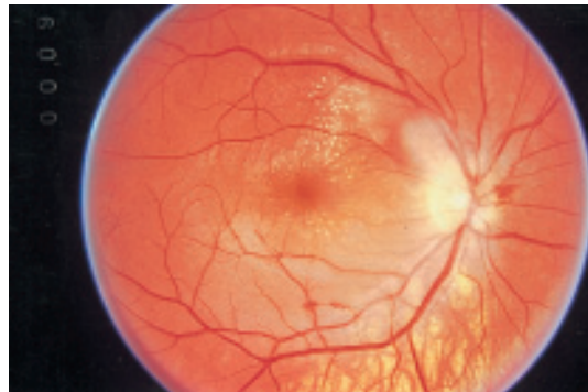
Fig 4. Disc edema with flame-shaped hemorrhages, venous dilation and macular star exudates. Note the retinal focus superotemporal to the disc.

An 18-year old caucasian man was referred to our department for sudden visual loss in the right eye. He reported no viral prodrome and had no cats. Best corrected visual acuity was 20/70 in the right eye and 20/20 in the left eye. Biomicroscopy was unremarkable in both eyes. An afferent pupillary defect was present in the right eye. Fundus examination of the right eye revealed disc edema surrounded by retinal hemorrhages, venous dilation and a focal lesion superotemporal to the disc. The fundus of the