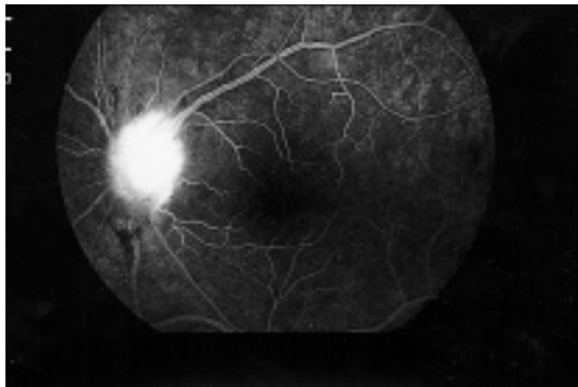
Fig 3. Staining of the optic disc and the superotemporal focus on fluorescein angiography.

Fluorescein angiography of the left eye demonstrated staining of the optic disc (especially superiorly) and of the superotemporal focus (Fig. 3). Color vision, contrast sensitivity and electroretinography of both eyes were within normal limits. Visually evoked potentials of the left eye showed slightly increased latencies. Several basic investigations were all found to be normal: a complete blood examination, chest X-ray, abdominal ultrasound, angiotensin-converting enzyme level, neurological examination including lumbar puncture and neuroimaging. The erythrocyte sedimentation rate was slightly elevated. Serologic tests for Lyme disease, syphilis and toxoplasmosis were negative. Serological indirect immunofluorescence tests detected antibodies to B. henselae at a dilution of 1/256, confirming the diagnosis of neuroretinitis caused by CSD. She was treated with oral ciprofloxacin 1g/day for 2 weeks. Follow-up 2 months later showed complete resolution of the fundus lesions and recovery of the visual acuity in the left eye to 20/20.